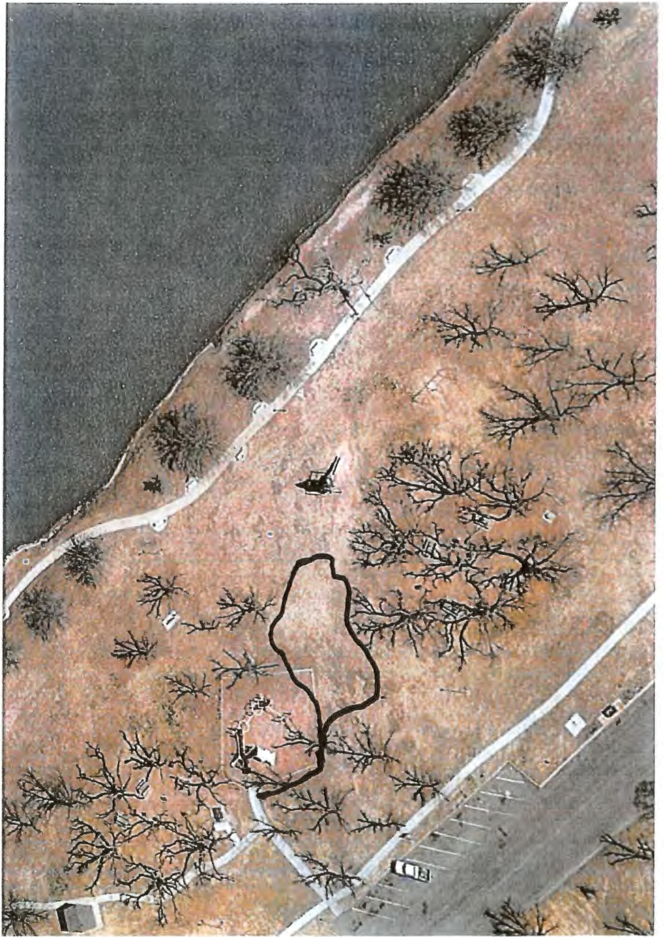
Friendship Park – Carlsbad NM 468 E Riverside Drive